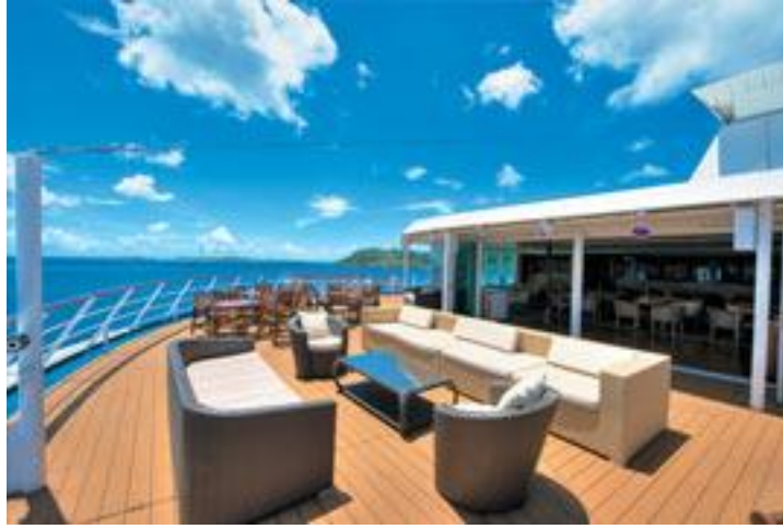
• The Paul Gauguin